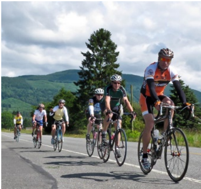
Fourth of July Ride: (2) we ride....

In this scarce nice weather, no one wants to write newsletter articles so for this month, photos will have to do. Get out and ride before the rain returns all too soon!