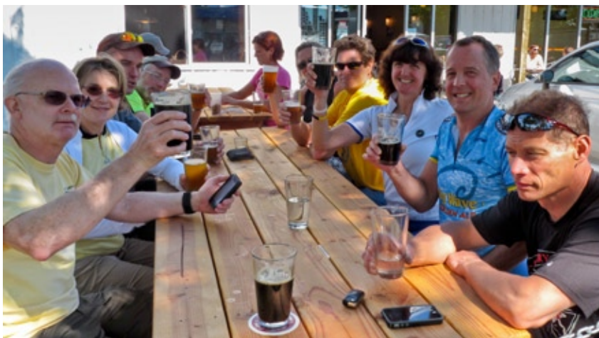
Fourth of July Ride: (3) we drink! (and eat... and enjoy the sun!)