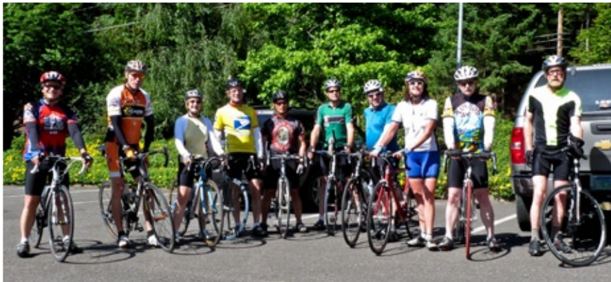
Fourth of July Ride: (1) we gather....