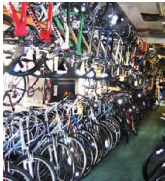
Rows and rows of inventory fill the 5000-sq ft store, including mountain bikes, road bikes, hybrids, cruisers, unicycles, and a large assortment of kid's bikes.

The early 1980's saw the advent of mountain bikes, which gave a huge "shot in the arm" to the American bicycling industry. Demand for offroad bicycles for recreation drove innovation for better components to withstand the demands of rough riding. This innovation led to improvements in road bicycles as well, and the world of bicycling saw a big resurgence. Mountain biking turned cycling into a less seasonal business, allowing people to ride during the winter in conditions in which road bikes and skinny tires aren't practical.