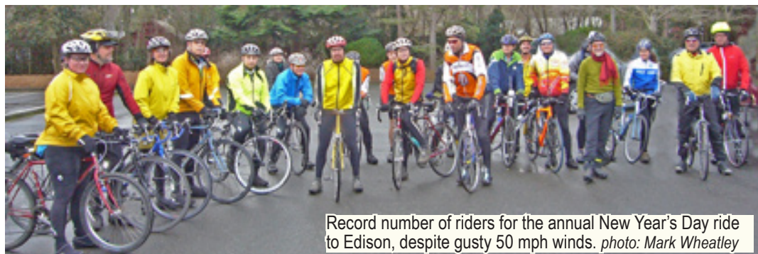
Record number of riders for the annual New Year's Day ride to Edison, despite gusty 50 mph winds.

Follow the club on Twitter: twitter.com/mtbakerbike